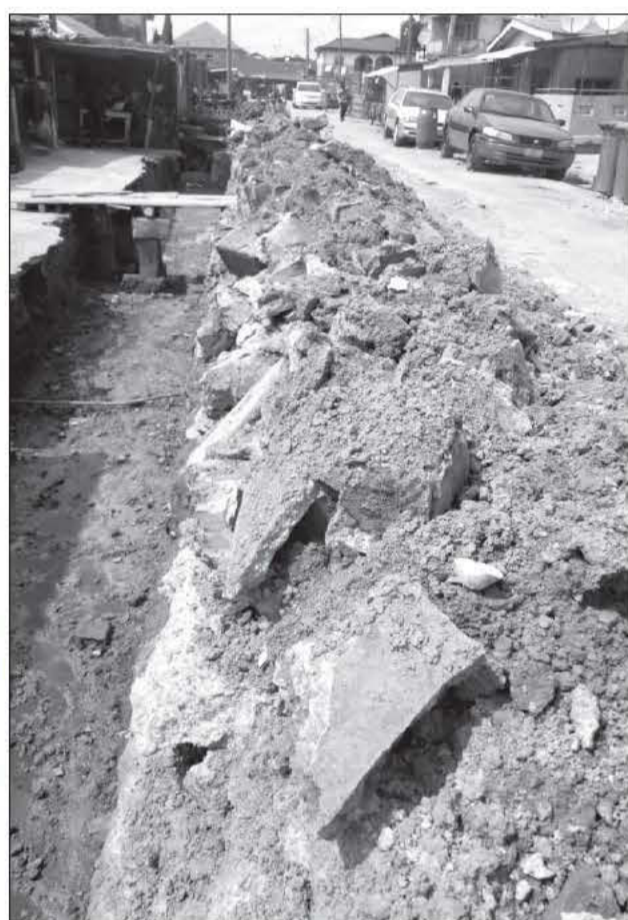
The drainage preparation in Jacob Taiwo Street

"The time frame for the project completion depends on the issues that we will come across during the drainage construction exercise, on the