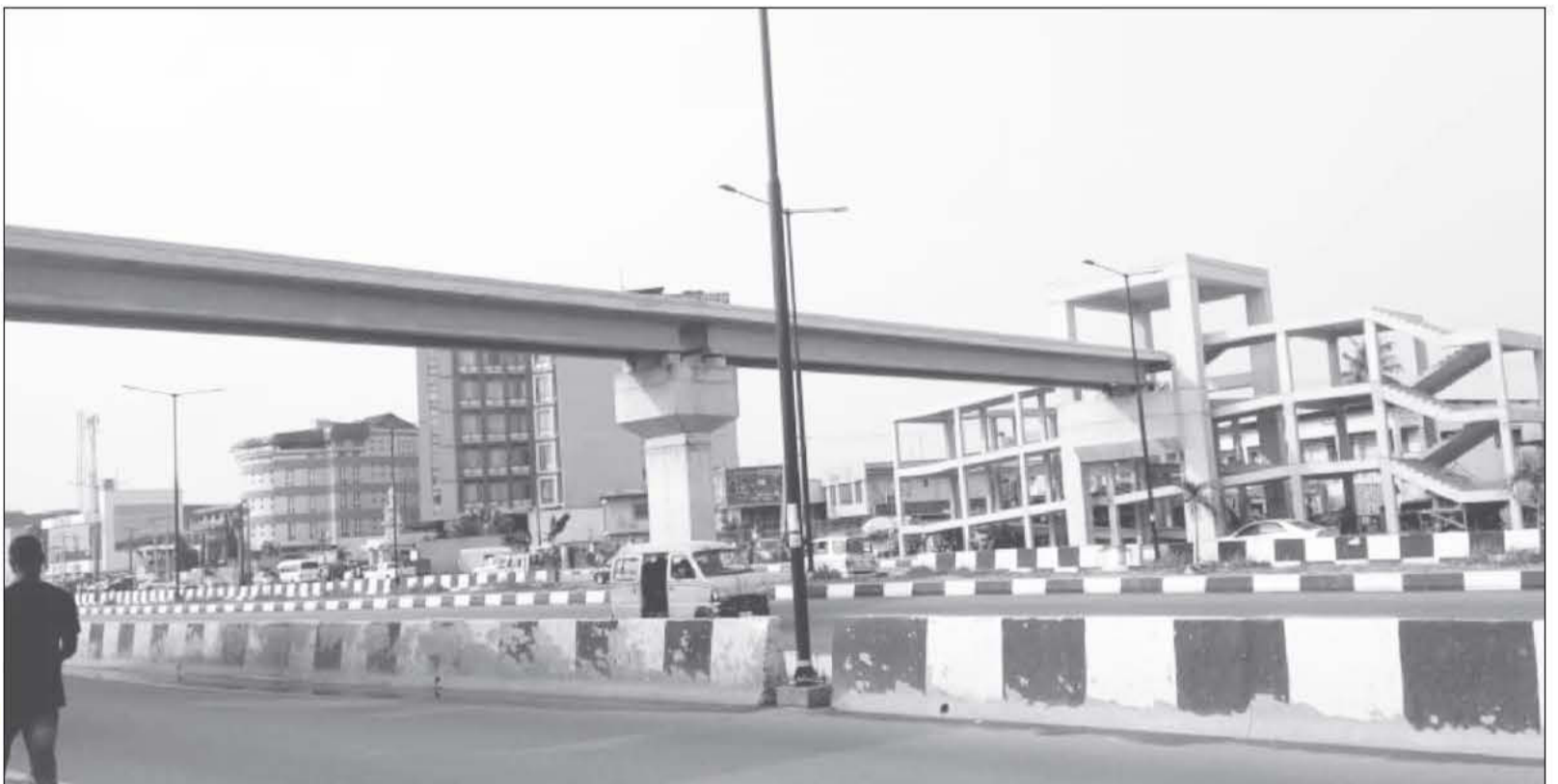
The pedestrian bridge in 7/8 Bus Stop

had also promised last year to facilitate the immediate completion as reported by ECHONEWS. However, the bridges were still uncompleted last week to complement the smoothly paved 10-lane road. Some of the commuters who complained to ECHONEWS,