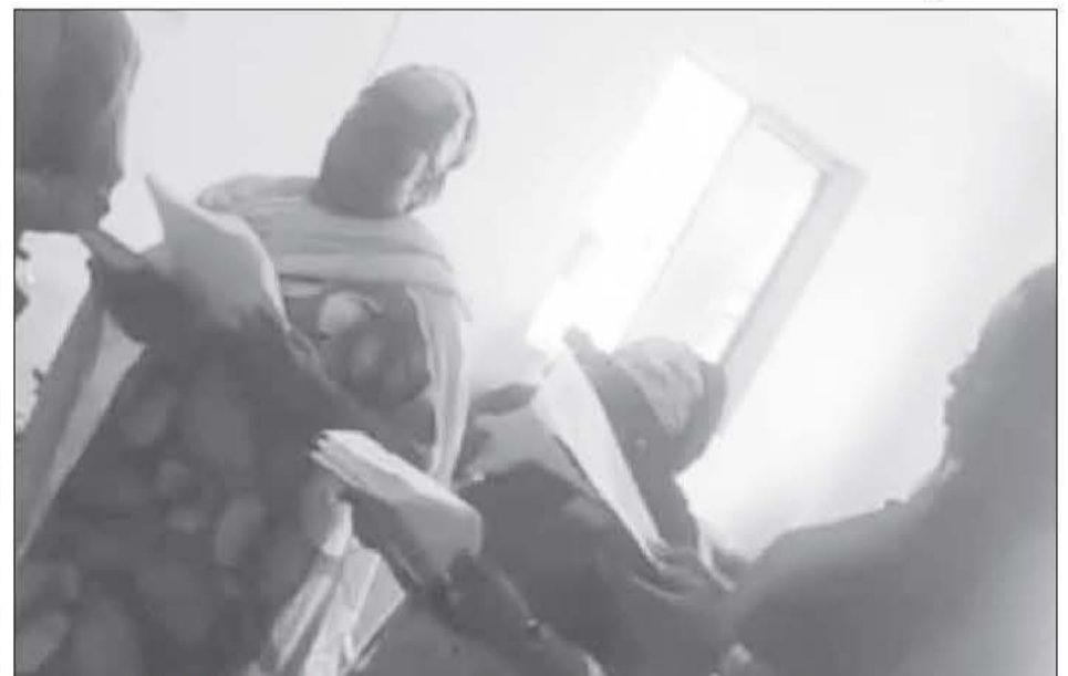
Caretakers taking oath of office