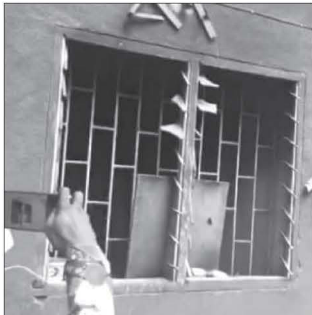
The burnt police post