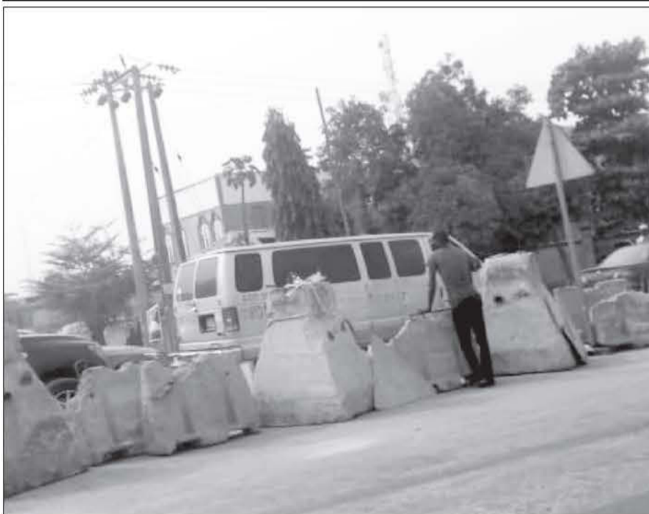
Five Star Junction gridlock