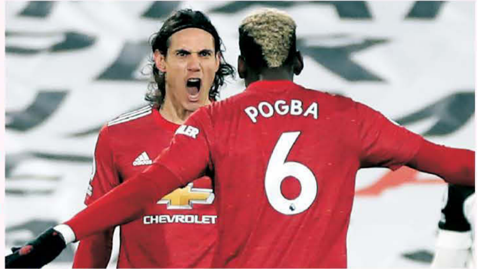
Edison Cavani and Paul Pogba

to have one," Pogba told MUTV after the game at Craven Cottage. "We know the hardest goals are those goals. We have talented players – Anthony Martial, Rashy in front, even Mason [Greenwood], that they can shoot from outside and stuff – but they don't have this, the experience of Edi, and they don't have the same quality of Edi as well." Ole Solskjaer's side will face Sheffield United in their next Premier league game.